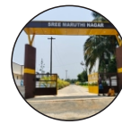
GRAND ENTRANCE ARCH