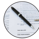
CLEAR TITLE DOCUMENT