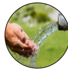
POTABLE DRINKING WATER