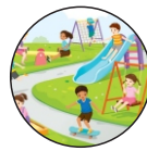
PARK & CHILDREN'S PLAY ARE